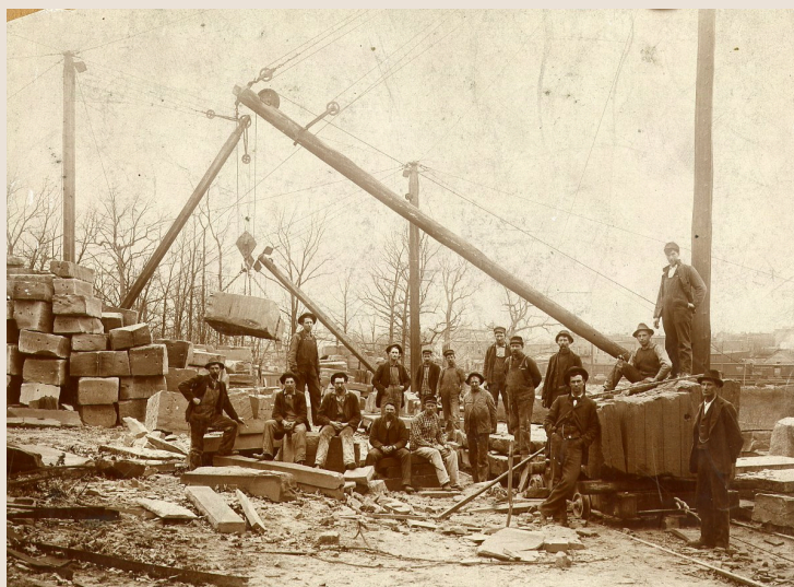
Stone Cutters