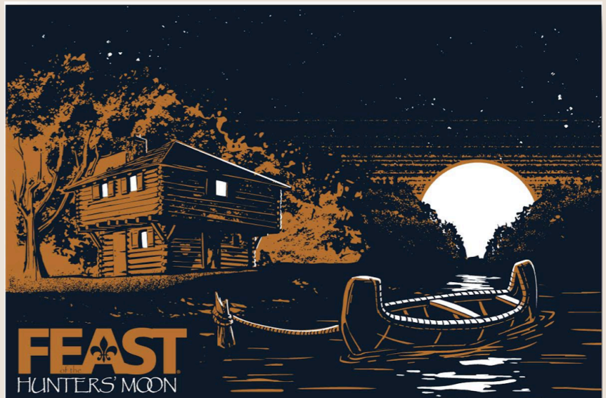
Artwork for the 2024 Feast of the Hunters' Moon

We are also now offering digital payment for applications! When sending in the app, simply select "Invoice" on the payment portion, to be sent an invoice for your fees. Let's work together for a smooth 2024 application season!